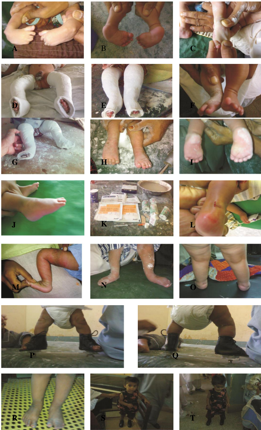
Fig No. 1: Summary of ponseti method from manipulation, serial casting, p/c tenotomy to bracing program